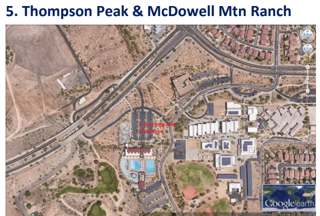
5. Thompson Peak & McDowell Mtn Ranch