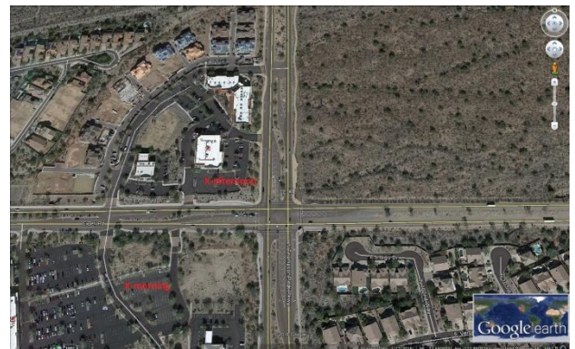
5. Thompson Peak & McDowell Mtn Ranch